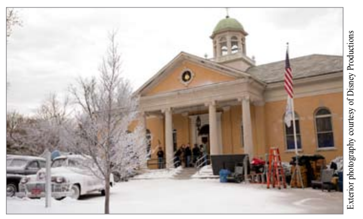
The crew takes a break while filming The Finest Hours. Artificial snow has been sprayed on the whole scene.