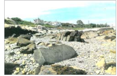
Jerusalem Road Stone, photograph by Gael Daly, 2014