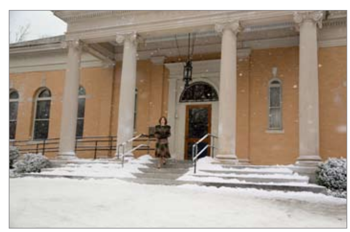
Actress Holliday Granger on the steps of the Pratt Building