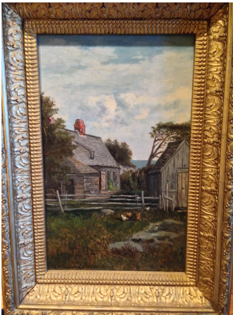
(first house on Jerusalem Road)