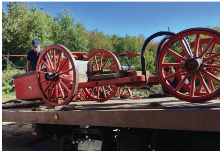
The Independence being taken off the flatbed truck as it arrives in Hope, ME.