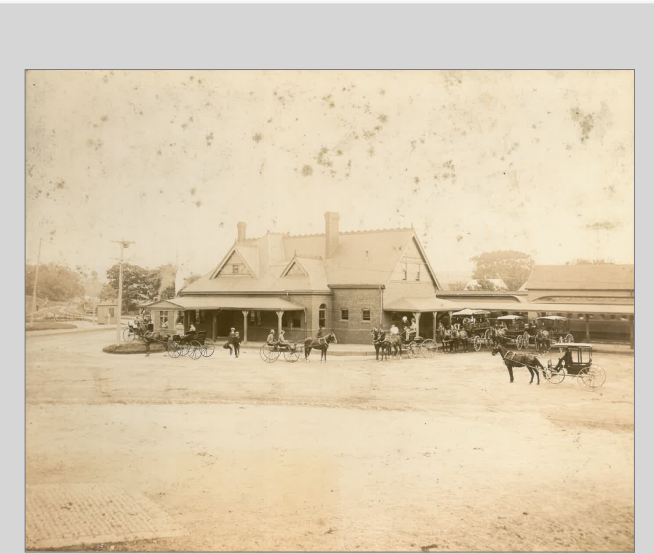
The third train station at Depot Court, 1887.

Passenger train service on the South Shore was discontinued in 1959, with the opening of the Southeast Expressway. In 1984, the MBTA began to study the feasibility of restoring commuter rail service to the South Shore to ease the area's transportation problems. After many years of debate and discussion, the Greenbush Rail Line of the MBTA was built along the established rail bed originally constructed in the 1850s. On October 31, 2007, regular commuter rail service returned to the South Shore. HH