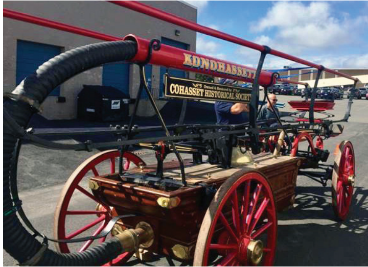
The Konohasset in line for refurbishment at Firefly Restoration.