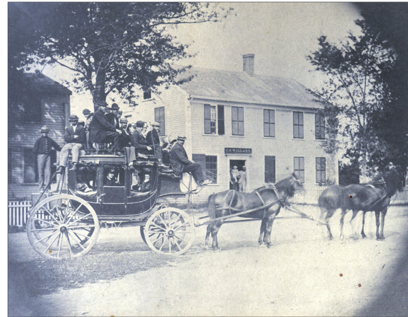
Passengers- piled up- on this stagecoach, which ran between Greenbush and the Hingham steamboat.