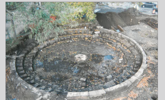
View of excavated turntable, 2004.